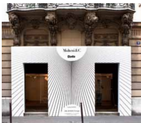
SCENOGRAPHY AND CURATING OF THE FLAGSHIP STORE MOLteni&C DADA.