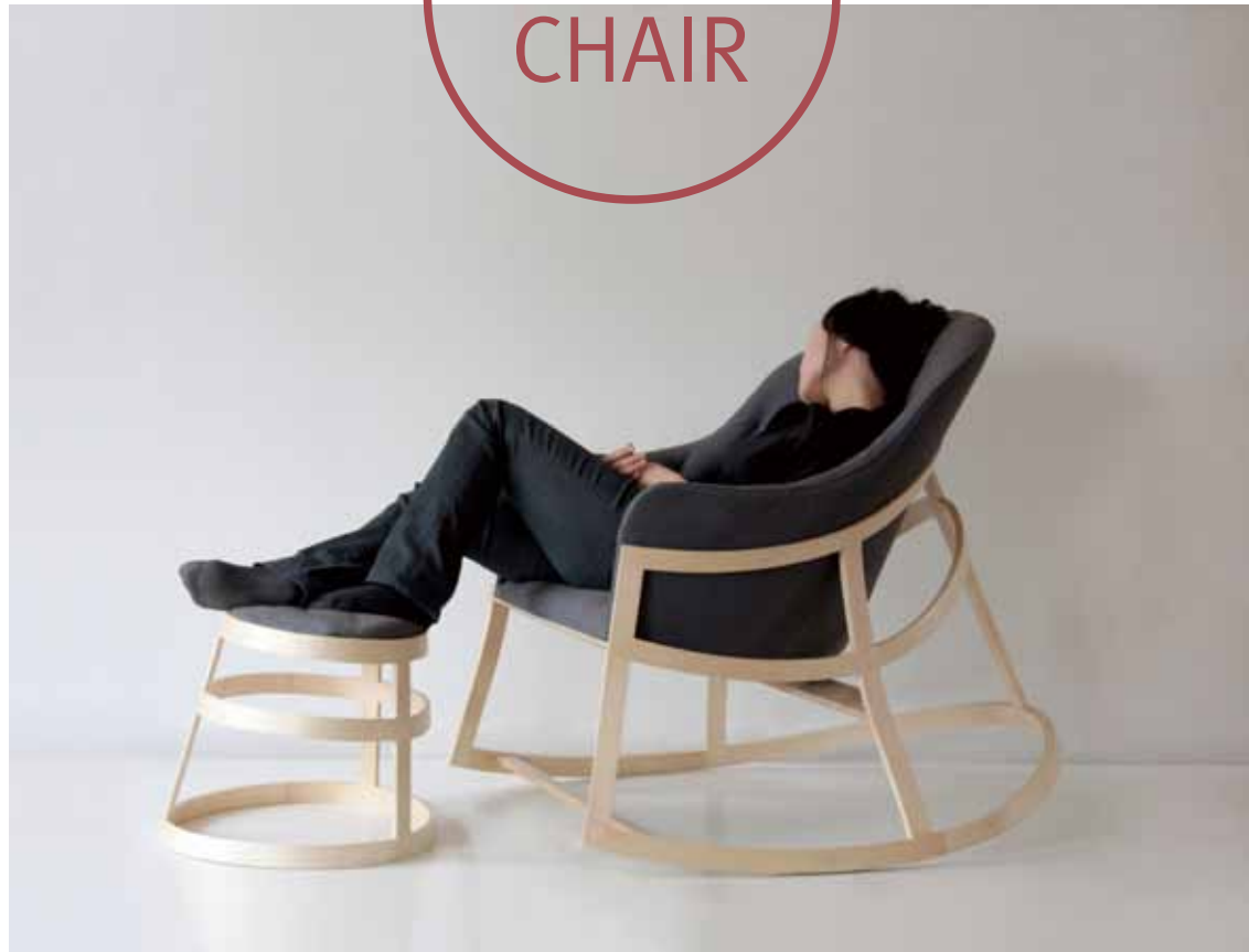
The seat rests in the wooden structure, as if suspended in a crinoline. It was presented at the Paris and Milan Furniture Fair 2009.