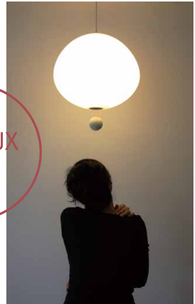
When the light is off, the switch is an autonomous sphere that can be stocked onto the lamp thanks to a magnet system. The user becomes an illusionist by turning the lamp on, just by approaching the switch. This work is prototype only.