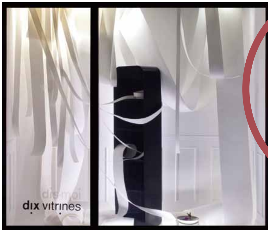
WINDOW DISPLAYS FOR GALERIES LAFAYETTE MAISON.