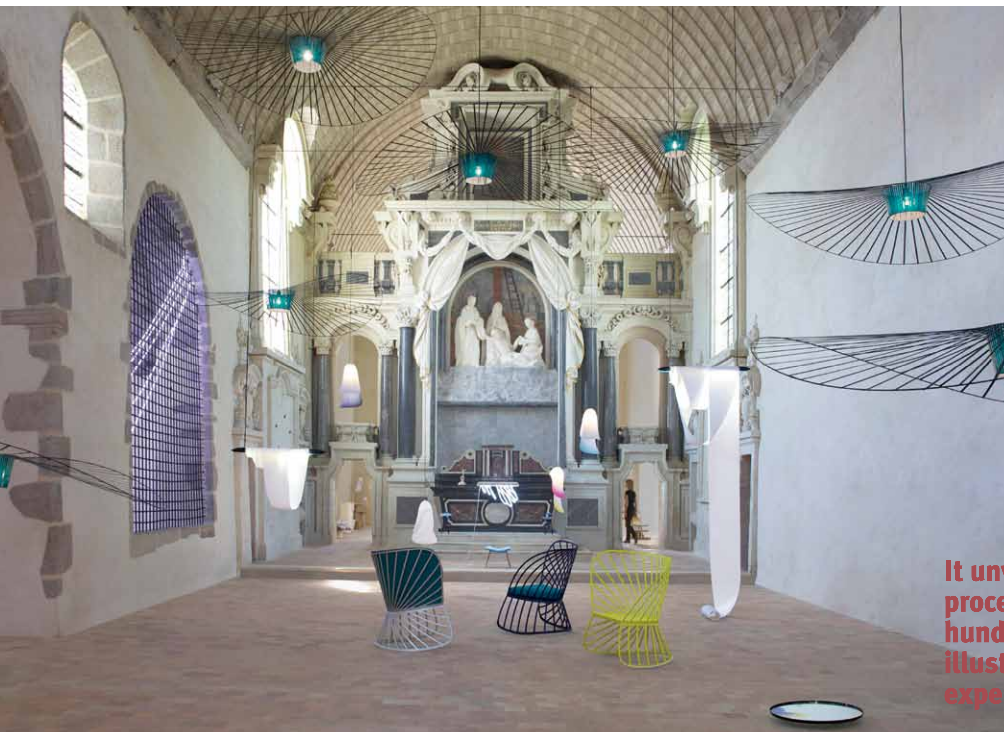
GENEROUS MODELS FLY SUSPENDED IN THE AIR LIKE A COLLECTION OF CLOTHES FRAMED IN COAT RACKS.

The nave hosts edited objects. Lamps, armchairs, mirrors, benches, pieces of cutlery, etc. are hung from the ceiling to the ground. The whole scene is visible at first sight but allows the visitor to experience several successive sensations and perspectives. The two lateral chapels are focused on video and scenography. In the first room, the visitor is invited to discover a movie from a round sofa made of Mayenne fabric. The second chapel