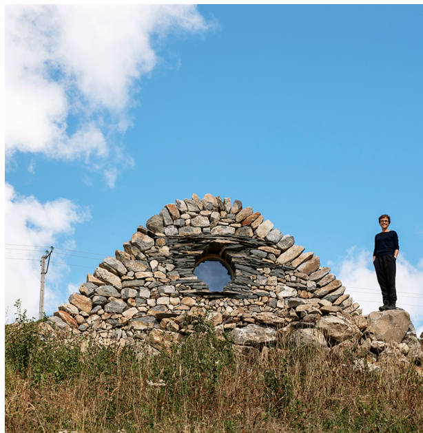
a shelter embedded in a rocky outcrop along the Camino in Haute-Loire, France