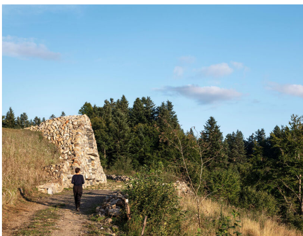
DA Constance Guisset Studio